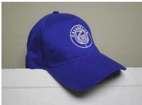
CALLERLAB CAP (Blue)

Colors: Royal Blue (RB), Black (BL), White (WH) Sport Grey (SG), Red (R)