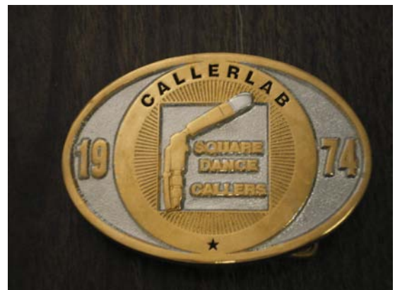
CALLERLAB BELT BUCKLE Polished Brass with silver

Send Orders to: CALLERLAB, 467 Forrest Ave., Suite 118, Cocoa Cocoa, FL 32922 or Email: JohnCALLERLAB@aol.com (Please allow 4-6 weeks delivery on badges and shirts.)